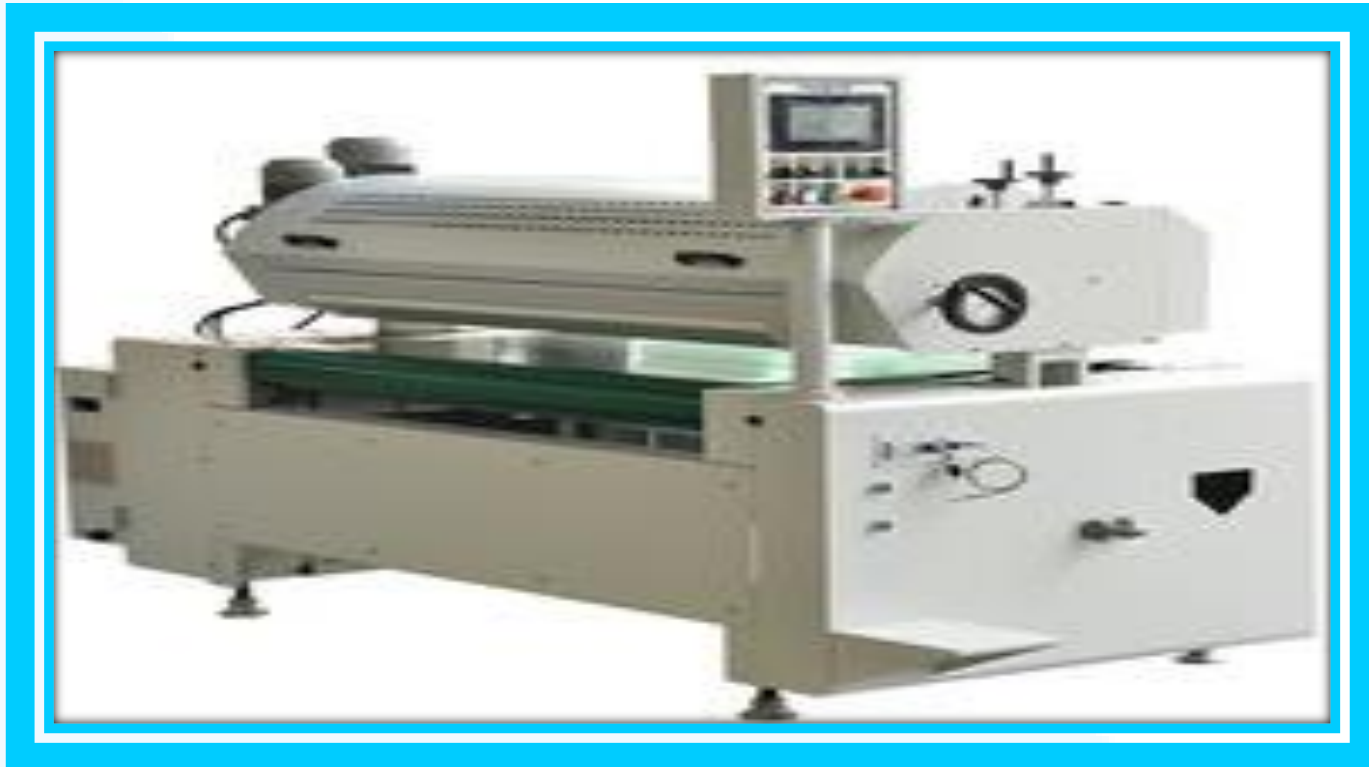
Polymer Coating Machine