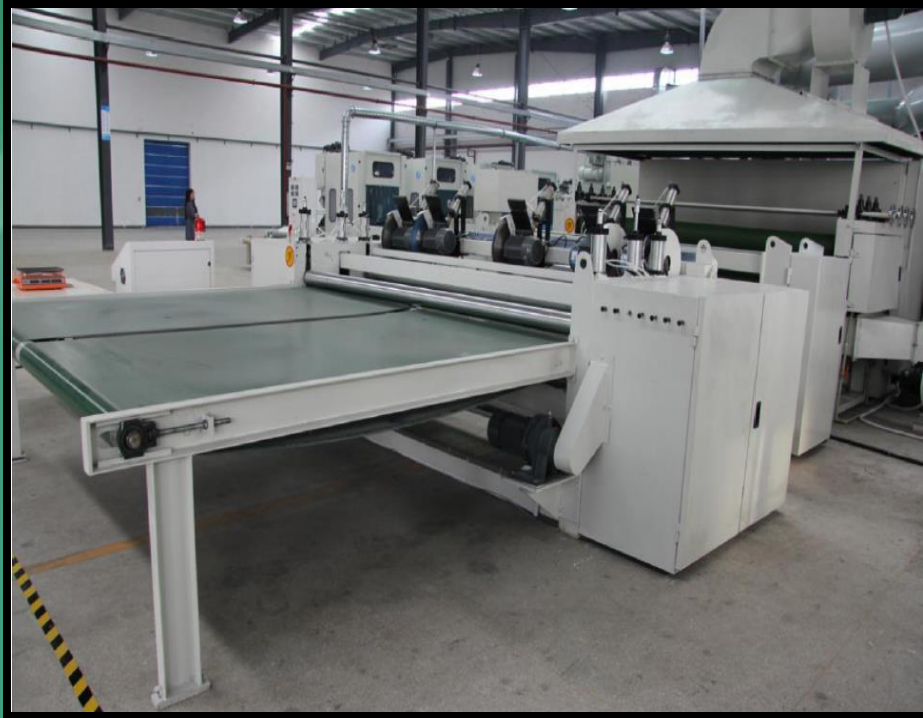
PIECE CUTTING MACHINE