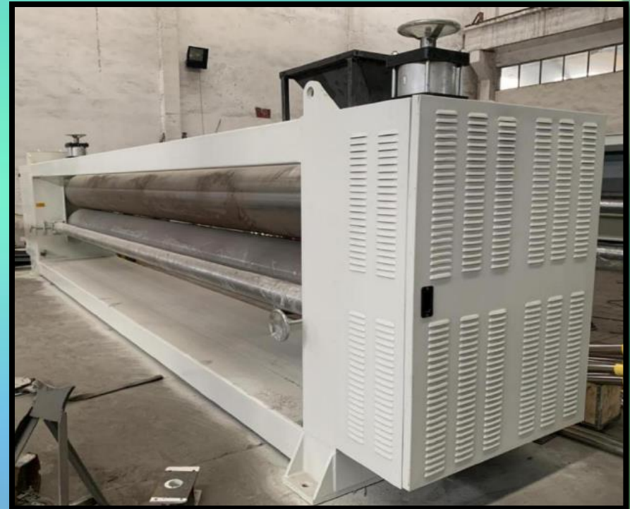
Double Roller Calender Machine