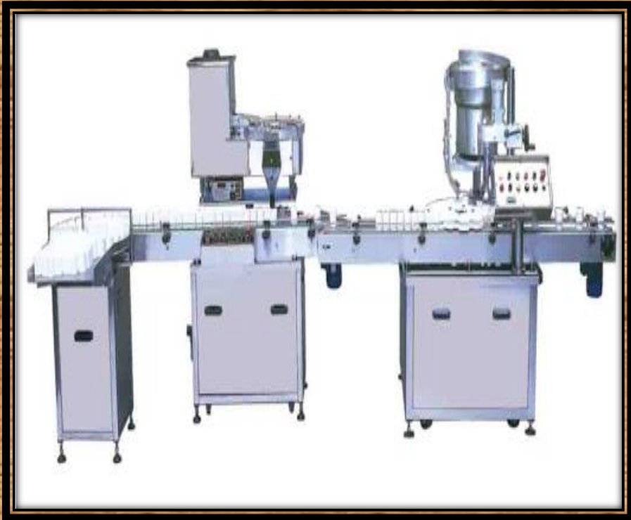
Automatic Packaging & Labelling Machine