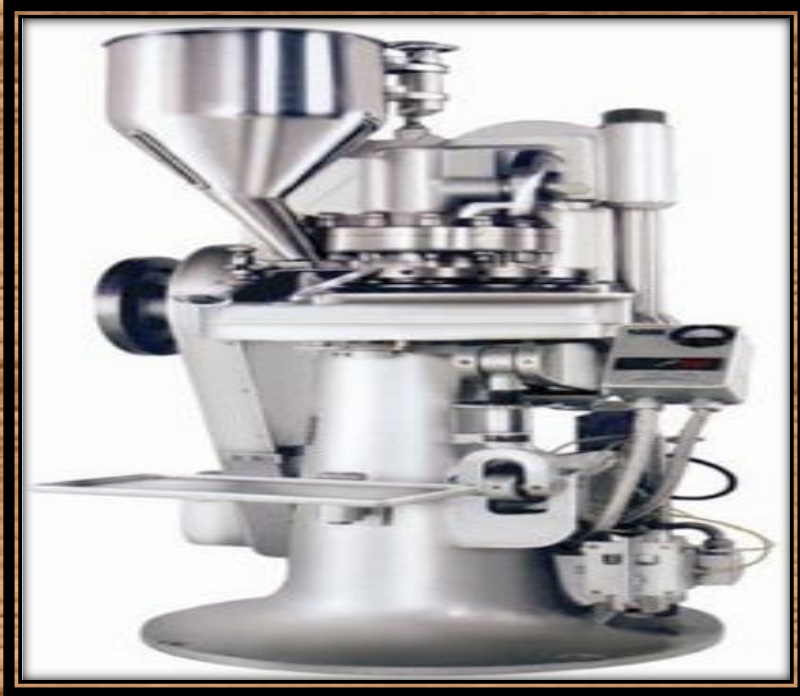
Tablet Compression Machine