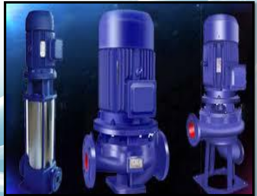
PIPELINE AND PUMP