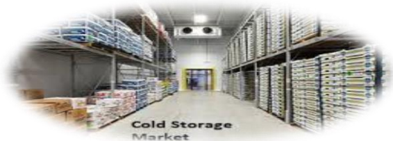
Cold Storage Market

PRESENT SCENARIO, FUTURE PROSPECTS, MARKET POTENTIAL, OPPORTUNITIES, GROWTH DRIVERS, INDUSTRY SIZE, ANALYSIS & FORECASTS