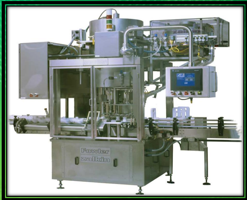
CAPPING MACHINE LASER