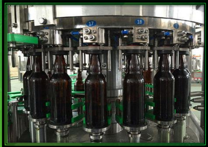
BOTTLE FILLING MACHINE WITH CAPPING