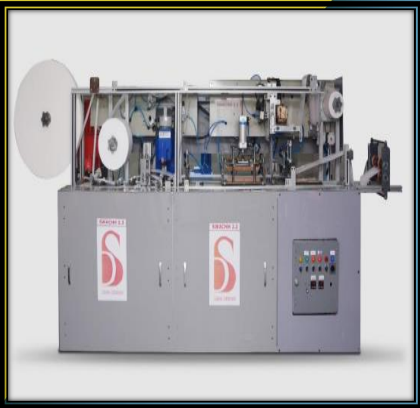
Pouching and Sealing Machine