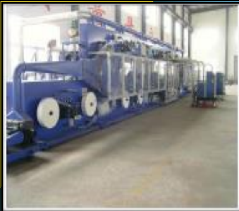
Full Frequency Sanitary Napkin Machine