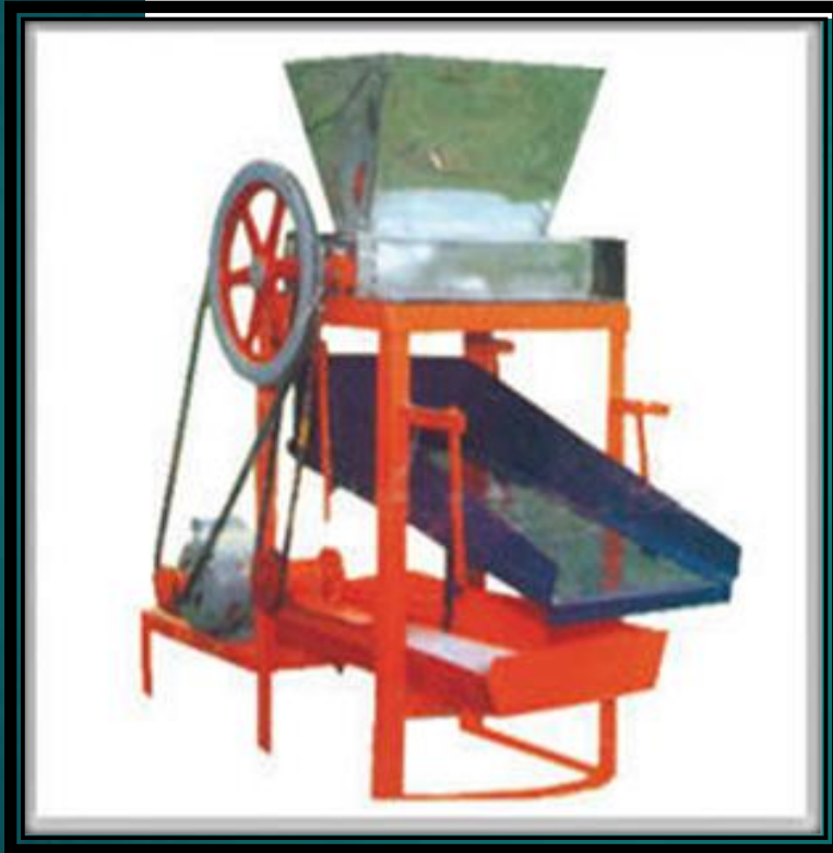
Supari Cutting Machine