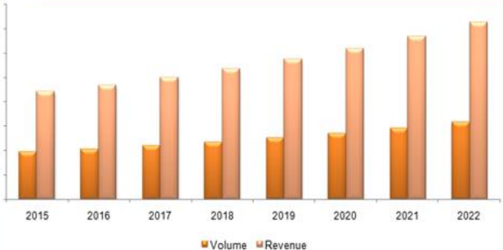
Global Camphor Tablets Market, 2015 – 2022, (Kilo Tons) (US$ Mn)