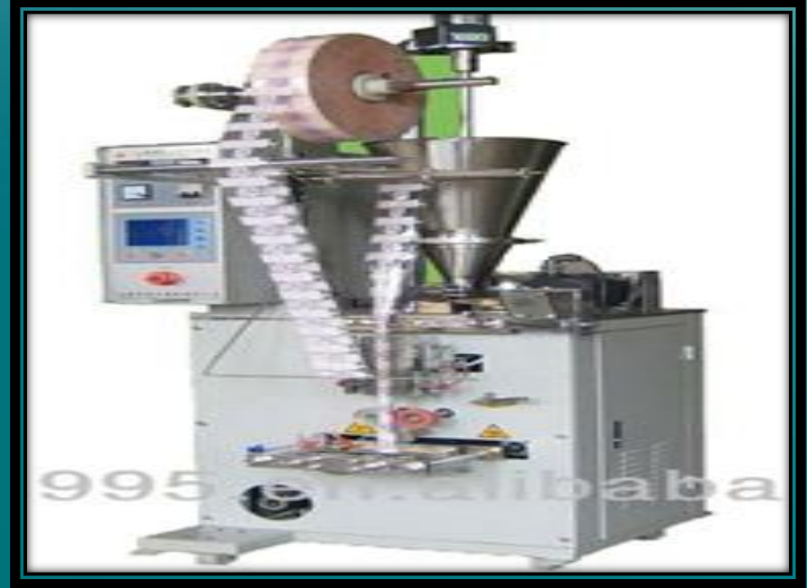
CAMPBOR POWDER PACKING MACHINE