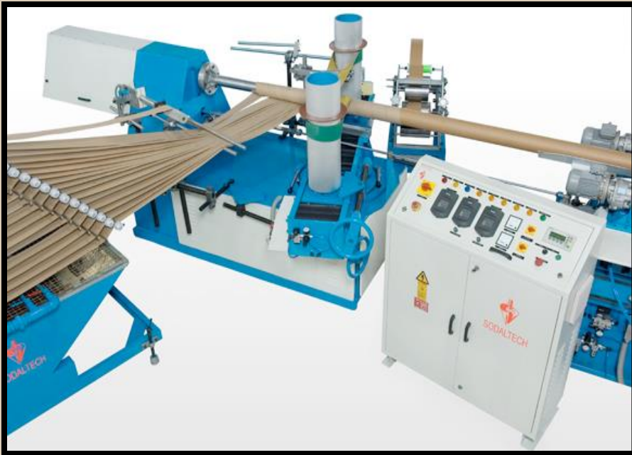
Single Belt Winder SPTM 500